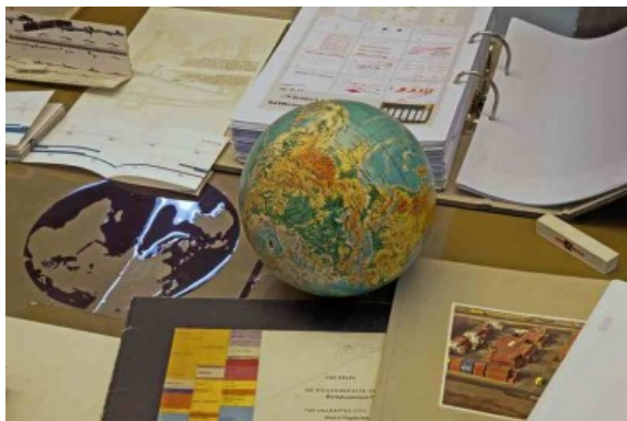
'Orban Space: Luc Deleu - T.O.P. office', overview at Stroom

In order to respond to this new scenario, the urban planner must act according to priorities, no longer based on "esthetic and style" elements but on a new "situation of 'do-it-yourself' architecture and self made cities" [2]. Differently from the figure of the utopian architect, the urbanist assumes primarily the function of the researcher, aiming at instigating new ways of thinking on architecture and urbanism. Besides researching on a specific subject matter it is also clear the importance in devising 'urban' tools and research methods, thus amplifying the scope of possibilities within urbanism itself. It is within this context that one can see the figure of the 'urbanist' taking action, and ultimately from the need to discuss the current praxis of urban planning.